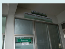
ICC Office in Chulalongkorn University