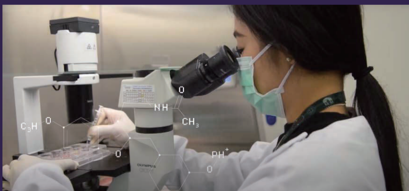
Student at Siriraj Hospital

TMDU and its long-time partner Faculty of Medicine Siriraj Hospital Mahidol University (MU) have conducted active student exchange since 1990, when a postgraduate from TMDU became a professor in the Surgery Department of Siriraj Hospital. In 2016, TMDU and MU signed an Inter-University Agreement, and, in November of 2017, established the "TMDU-MU Partnership Siriraj Office" at Siriraj Hospital. The Joint Degree Doctoral Program in Medical Sciences between TMDU and Mahidol University (MU) was formed in April 2020, following the conclusion of the Academic Cooperation Agreement in August of 2019. The Joint Degree Program (JDP) with MU aims to train highly specialized medical professionals in oncology and develop global leaders in the medical field within the ASEAN region. The JDP became the first clinical doctoral program in Thailand.