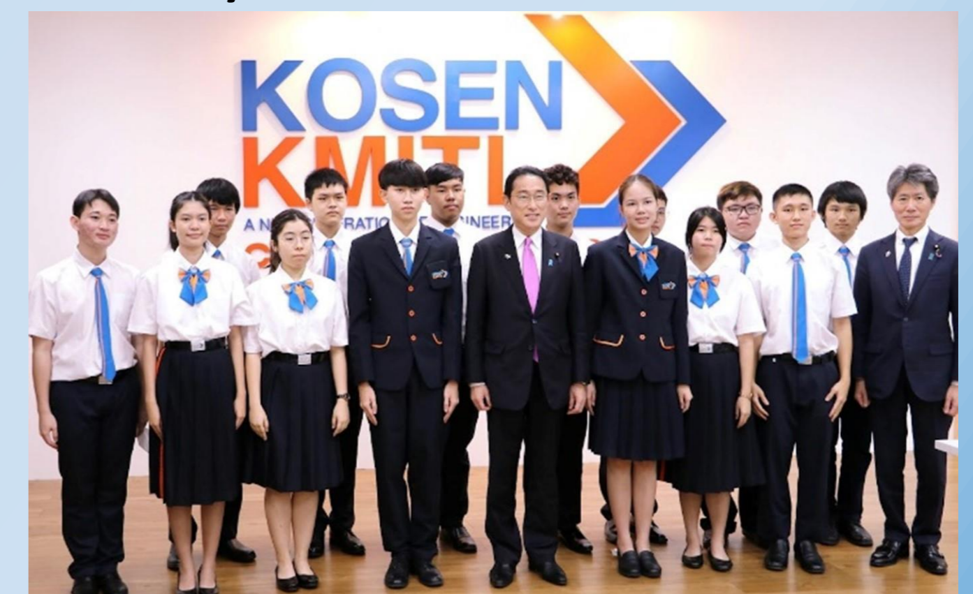
▲ Visit at KOSEN-KMITL by Prime Minister of Japan

NIT has been building a comprehensive partnership with Thai government and supporting the human resource development of practical and innovative engineers by the KOSEN education. KOSEN-KMITL at the KMITL and KOSEN KMUTT at the KMUTT have been established as Japanese style KOSEN in Thailand.