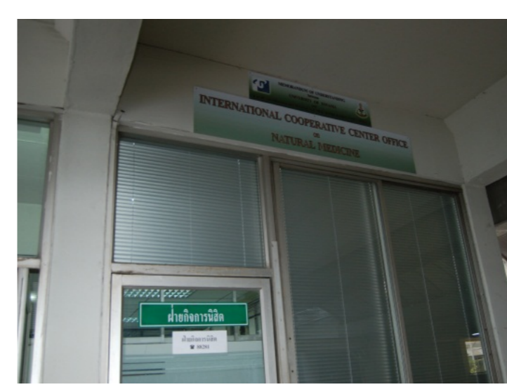
ICC Office in Chulalongkorn University