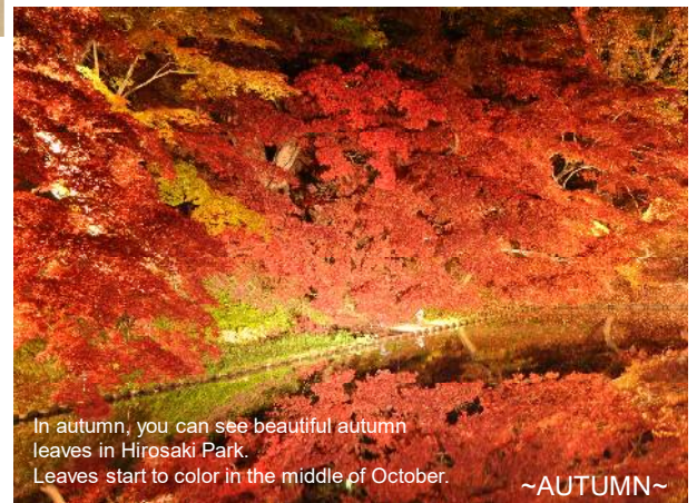
In autumn, you can see beautiful autumn leaves in Hirosaki Park. Leaves start to color in the middle of October.

We hope to give international students a taste of traditional Japanese culture through our courses that can only be experienced in Hirosaki University.