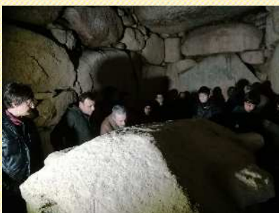
Joint Project with Europe "BE-ARCHAEO"