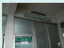
ICC Office in Chulalongkorn University