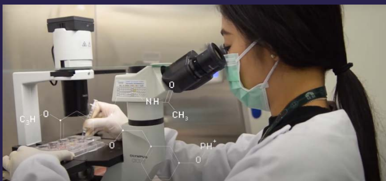
Student at Siriraj Hospital

TMDU and its long-time partner Faculty of Medicine Siriraj Hospital Mahidol University (MU) have conducted active student exchange since 1990, when a postgraduate from TMDU became a professor in the Surgery Department of Siriraj Hospital. In 2016, TMDU and MU signed an Inter-University Agreement, and, in November of 2017, established the "TMDU-MU Partnership Siriraj Office" at Siriraj Hospital. The Joint Degree Doctoral Program in Medical Sciences between TMDU and Mahidol University (MU) was formed in April 2020, following the conclusion of the Academic Cooperation Agreement in August of 2019. The Joint Degree Program (JDP) with MU aims to train highly specialized medical professionals in oncology and develop global leaders in the medical field within the ASEAN region. The JDP became the first clinical doctoral program in Thailand.