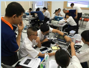
Thai and Japanese Professors conducting a class at KOSEN-KMITL

NIT is also supporting to implement engineering education in Premium Education Courses at Chonburi and Suranaree Technical Colleges that were opened in 2018. The first batch students will graduate in 2023.