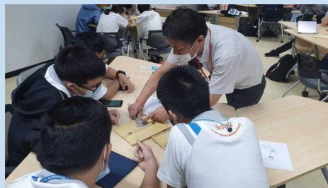
Japanese Professor conducting a class at KOSEN KMUTT