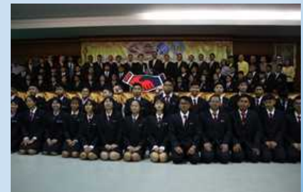
Opening Ceremony of Premium Course

KOSEN(National Institute of Technology), Headquarters