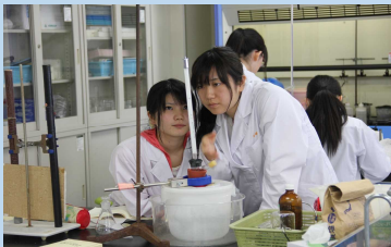
Chemistry and Biochemistry, Materials Science