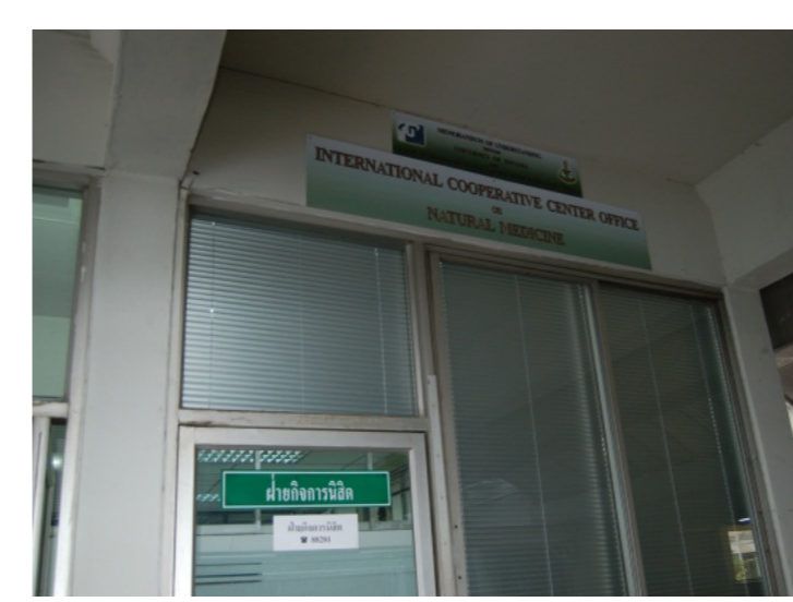
ICC Office in Chulalongkorn University