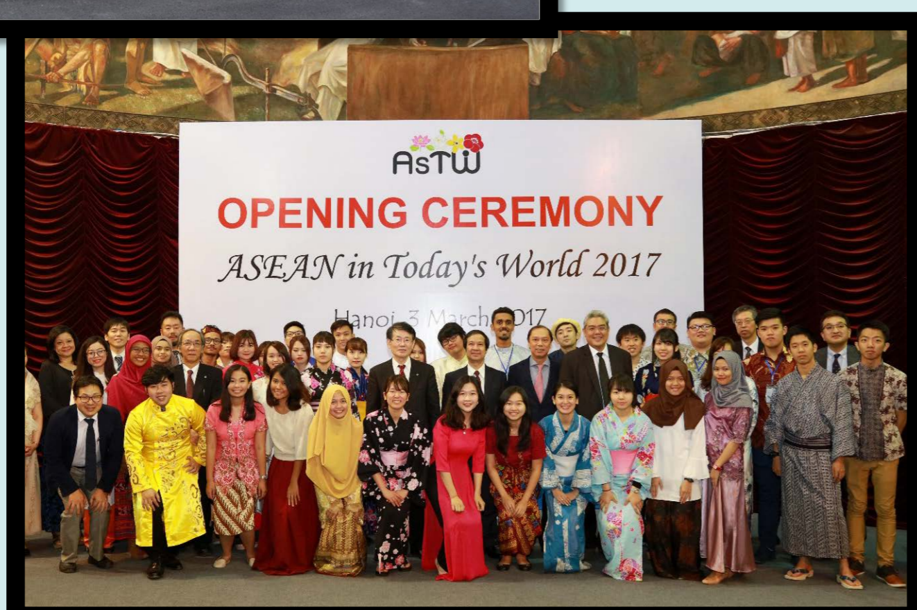
AsTW OPENING CEREMONY ASEAN in Today's World 2017