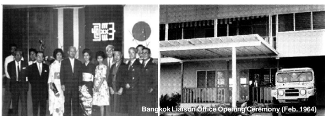
Bangkok Liaison Office Opening Ceremony (Feb. 1964)

Established in 1963, The Bangkok Liaison Office of the Center for Southeast Asian Studies has been acting as a hub for interdisciplinary collaboration and research in area studies.