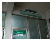
ICC Office in Chulalongkorn U.