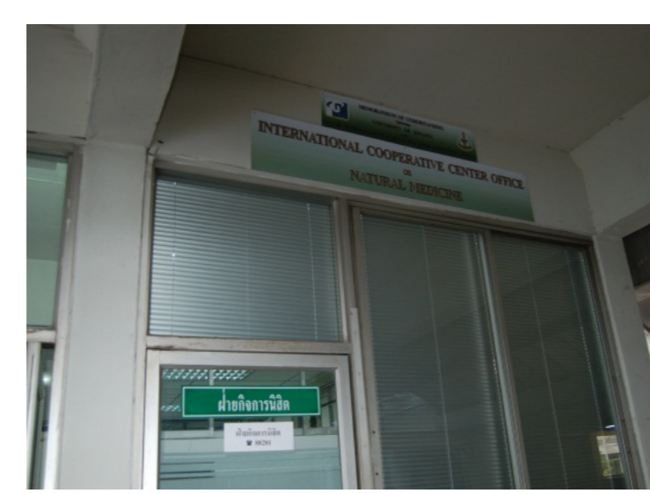
ICC Office in Chulalongkorn U.