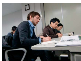
730 foreign students