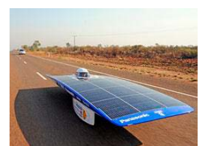
World fastest solar car