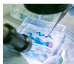
Diverse research fields