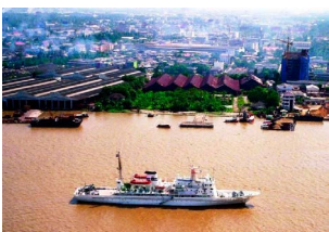
University's "Bosei Maru"

The university promotes state-of-the-art research activities for future generations. The main research areas include nanotechnology and life science. The university also supports building academia business cooperation in applying research outcomes.