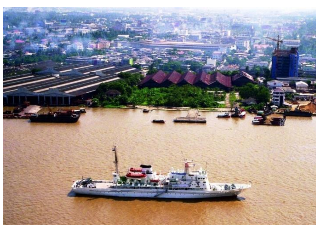
University's "Bosei Maru"

The university promotes state-of-the-art research activities for future generations. The main research areas include nanotechnology and life science. The university also supports building academia business cooperation in applying research outcomes.