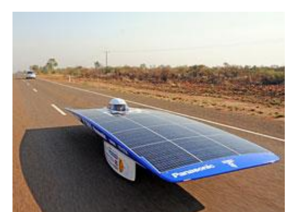
World fastest solar car