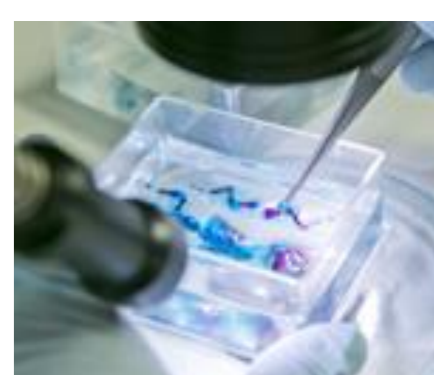
Diverse research fields