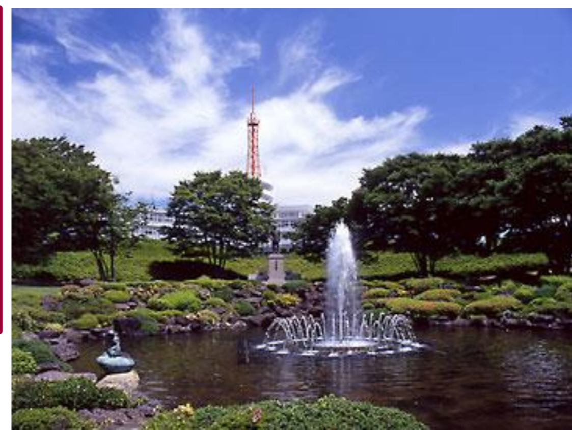
Main campus in summer

Cultivate your thoughts in your early days Nurture your body in your early days Develop your intellect in your early days Aim your hopes towards the stars in your early days