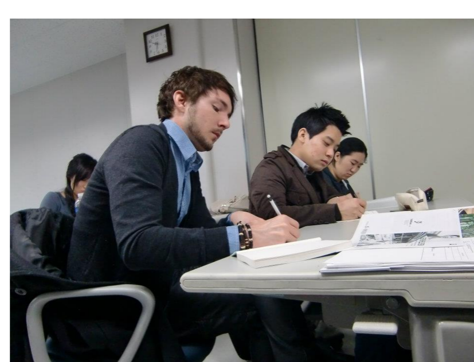
750 foreign students