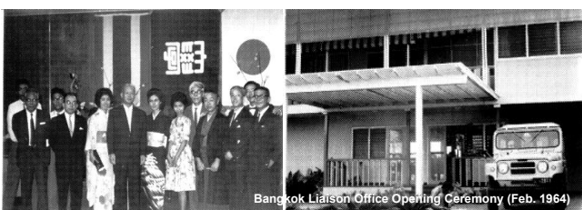
Bangkok Liaison Office Opening Ceremony (Feb. 1964)

Established in 1963, The Bangkok Liaison Office of the Center for Southeast Asian Studies has been acting as a hub for interdisciplinary collaboration and research in area studies.