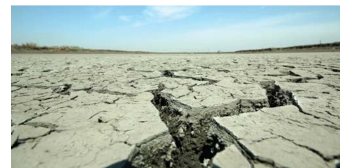
Disaster Risk Reduction and Management