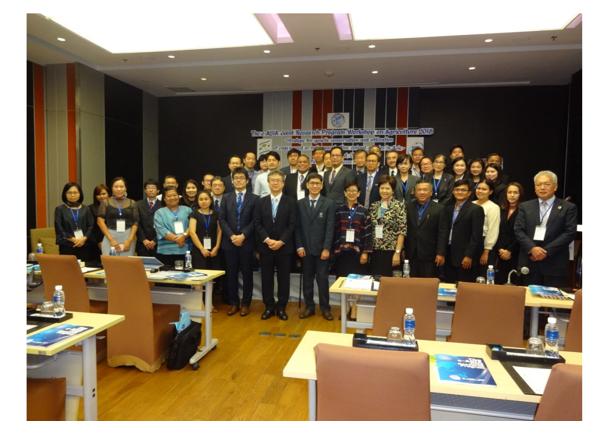
"Strategy for genetic conservation and Utilization of endangered or indigenous/native animal species in ASIA" Bangkok, Thailand March 1-2, 2018