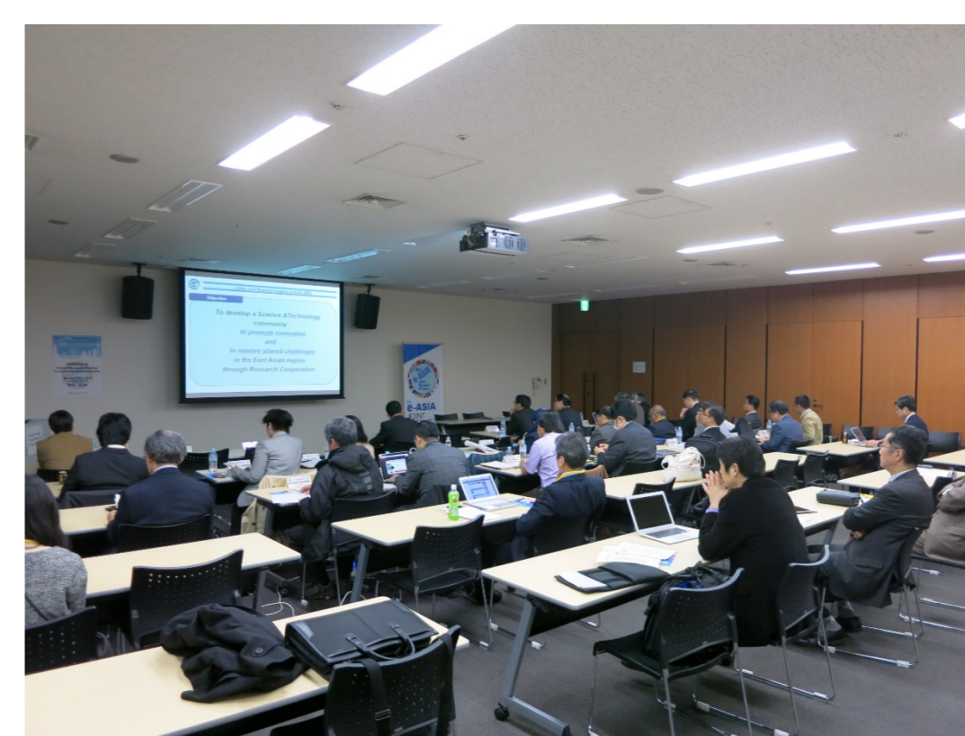
"Green and Bio Nanotechnology" Tokyo, Japan January 30, 2016