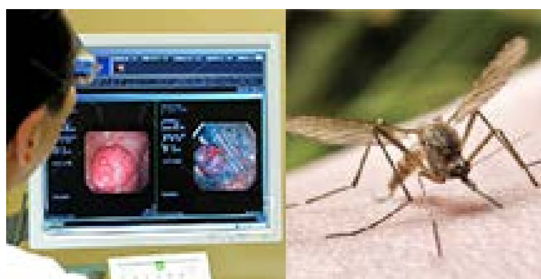
Health Research (Infectious Diseases, Cancer)