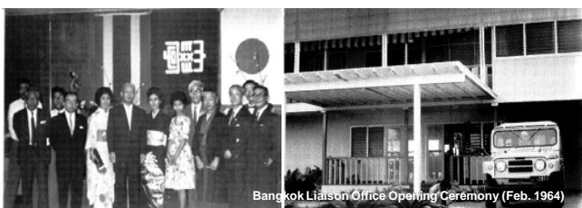
Bangkok Liaison Office Opening Ceremony (Feb. 1964)

International Collaborations: To encourage cooperation with local and national society and disseminate knowledge informed by the ideals of freedom and peaceful coexistence.